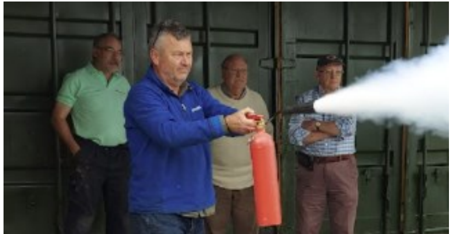
Fire Equipment Training and Commissioning to ensure all are safe